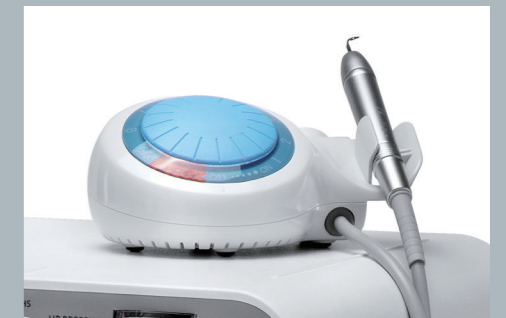
Veterinary Ultrasonic Scaler (Optional)