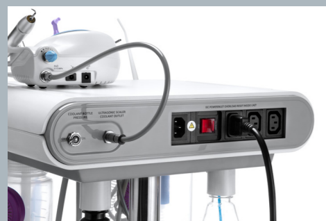
Ultrasonic Scaler Coolant Outlet

The whole machine weighs only 46kg, flexible movement with super smooth casters.