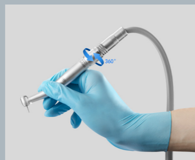
High Speed Handpiece